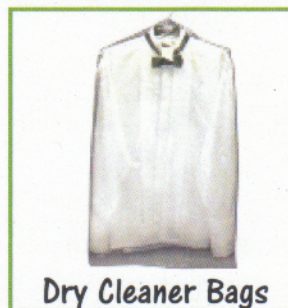
Dry Cleaner Bags