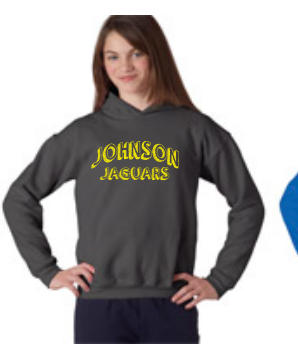
Charcoal Pullover Hooded 50/50 Sweatshirt with Johnson Jaguars design printed in Gold on front.