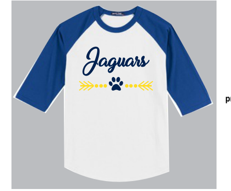
3/4 Sleeve White/Royal Blue 100% Ring Spun Combed Cotton Jersey with Jaguars Script design printed in Royal Blue & Gold on front.