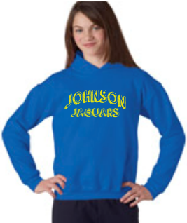
Royal Blue Pullover Hooded 50/50 Sweatshirt with Johnson Jaguars design printed in Gold on front.