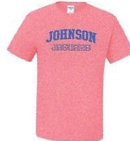
Short Sleeve 50/50 Cotton/Poly T-Shirt with Johnson Jaguars design printed in Royal on front. AVAILABLE IN NEON PINK.