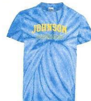
Short Sleeve 100% Cotton Tie-Dye T-Shirt with Johnson Jaguars design printed in Gold on front. AVAILABLE IN ROYAL BLUE.