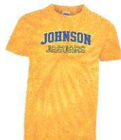
Short Sleeve 100% Cotton Tie-Dye T-Shirt with Johnson Jaguars design printed in Royal on front. AVAILABLE IN GOLD.