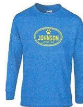
Long Sleeve 100% Cotton T-Shirt with Johnson Oval design printed in Gold on front. AVAILABLE IN ROYAL BLUE.