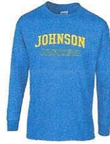
Long Sleeve 100% Cotton T-Shirt with Johnson Jaguars design printed in Gold on front. AVAILABLE IN ROYAL BLUE.