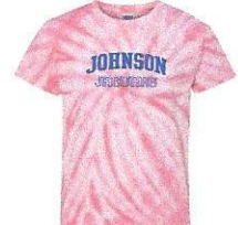
Short Sleeve 100% Cotton Tie-Dye T-Shirt with Johnson Jaguars design printed in Royal on front. AVAILABLE IN PINK.