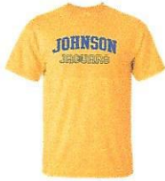
Short Sleeve 100% Cotton T-Shirt with Johnson Jaguars design printed in Royal on front. AVAILABLE IN GOLD.