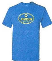
Short Sleeve 100% Cotton T-Shirt with Johnson Oval design on front printed in Gold. AVAILABLE IN ROYAL BLUE.