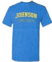
Short Sleeve 100% Cotton T-Shirt with Johnson Jaguars design printed in Gold on front. AVAILABLE IN ROYAL BLUE.