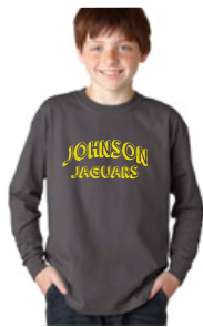
Charcoal Long Sleeve 100% Cotton T-Shirt with Johnson Jaguars design printed in Gold on front.