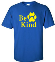
Royal Blue Short Sleeve 100% Cotton T-Shirt with Be Kind design on front printed in Yellow Gold.