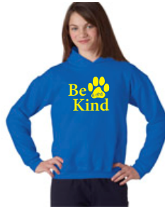
Royal Blue Pullover Hooded 50/50 Sweatshirt with Be Kind design on front printed in Yellow Gold.