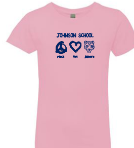
Girls Light Pink 4.3 oz Ring Spun Cotton short sleeve T-shirt with Peace Love Jaguars design on front printed in Royal Blue.