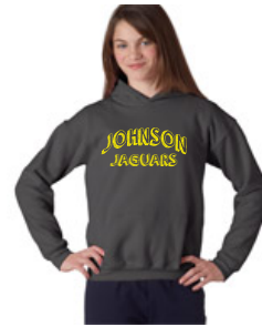
Charcoal Pullover Hooded 50/50 Sweatshirt with Johnson Jaguars design printed in Gold on front.