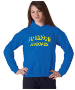
Royal Blue Pullover Hooded 50/50 Sweatshirt with Johnson Jaguars design printed in Gold on front.