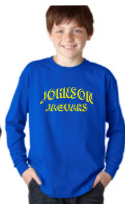
Royal Blue Long Sleeve 100% Cotton T-Shirt with Johnson Jaguars design printed in Gold on front.