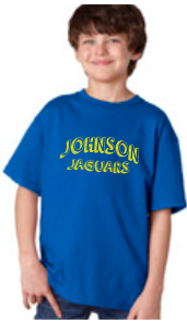
Royal Blue Short Sleeve 100% Cotton T-Shirt with Johnson Jaguars design printed in Gold on front.