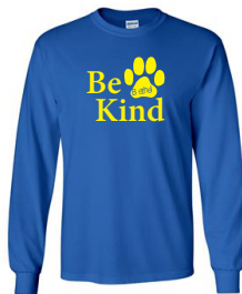
Royal Blue Long Sleeve 100% Cotton T-Shirt with Be Kind design on front printed in Yellow Gold.