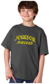
Charcoal Short Sleeve 100% Cotton T-Shirt with Johnson Jaguars design printed in Gold on front.