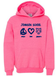
Safety Pink Pullover Hooded 50/50 Sweatshirt with Peace Love Jaguars design on front printed in Royal Blue.