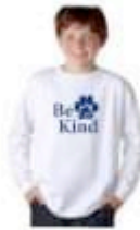
Write Long Sleeve 100% Cotton T-Shirt with Be Kind design on front printed in Royal Blue.