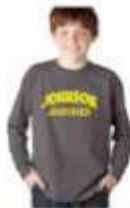
Charcoal Long Sleeve 100% Cotton T-Shirt with Johnson Jaguars design printed in Gold on front.