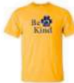
Gold Short Sleeve 100% Cotton T-Shirt with Be Kind design on front printed in Royal Blue.