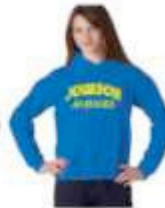
Royal Blue Pullerose Hooded $0/50 Sweatshirt with Johnson Jaguars design printed in Gold on front.