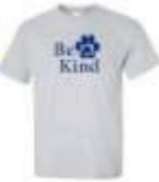
Sport Grey Short Sleeve 100% Cotton T-Shirt with Be Kind design on front printed in Royal Blue.