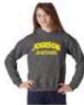
Charcoal Pullover Hooded Sweatshirt with Johnson Jaguars design printed in Gold on front.