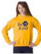
Gold Pullover Hooded Sweatshirt with Be Kind design on front printed in Royal Blue.