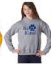
Sport Grey Pullover Hooded Sweatshirt with Be Kind design on front printed in Royal Blue.